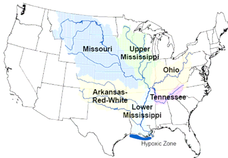
Figure 1. The Mississippi River watershed, major tributary watersheds and the hypoxic zone. (Figure from Greene 2006).

In estuaries such as the northern Gulf of Mexico, a layer of oxygen-rich freshwater overlies the denser, oxygen-depleted salt water. In the summertime, calm weather intensifies this stratification, with little mixing between the two layers. The result is a hypoxic zone in the Gulf. Many aquatic species cannot survive in hypoxic conditions. The spread of hypoxia reduces the available habitat for species that are important both for the functioning of the ecosystem and for the Gulf’s commercial fishing industry.